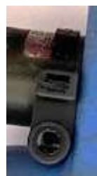
NFC RFID ZIPTIE

Add low cost NFC/RFID ZIPTIE, PEEL 'n STICK LABEL or HARD TAG to track these assets.